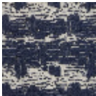
FT200002 Bleu nuit