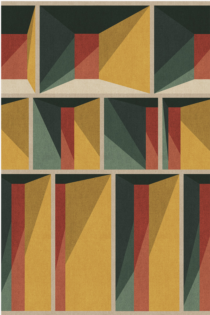
FT282001 - Cocktail

A celebration of Brutalist architecture, of which the Velasca Tower in Milan is one of the most notable examples, this geometric composition plays with perspective like light on a façade. Hand-tufted with cut pile in New-Zealand wool.