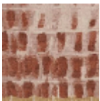
FT338002 TERRE D'EGYPTE