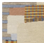
FT441001 MULTICOLOR E