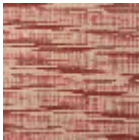
IT111005 Brique rose