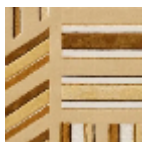
BT109002 Ocre jaune