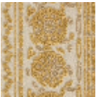
BT112002 Ocre jaune