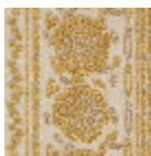
BT112002 Ocre jaune