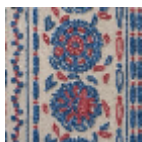
BT112001 Ocre hortensia