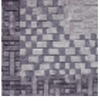
FT147001 Bleu pastel