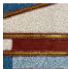
FT207002 Bleu nattier