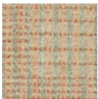
FT243002 TERRE CUITE