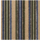
FT254001 Bleu marine