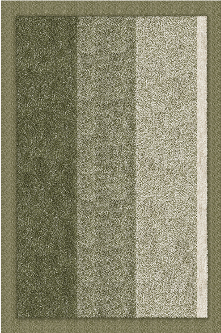
FT257003 - Vert-de-gris

This rug is a pure mix of materials, flecked throughout in a search for a balance between textures. The cut velvet is made in New Zealand wool and botanical silk and is framed by a very short heathered loop in wool and shiny nylon.