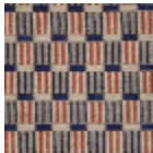
FT333001 RIVE DU NIL