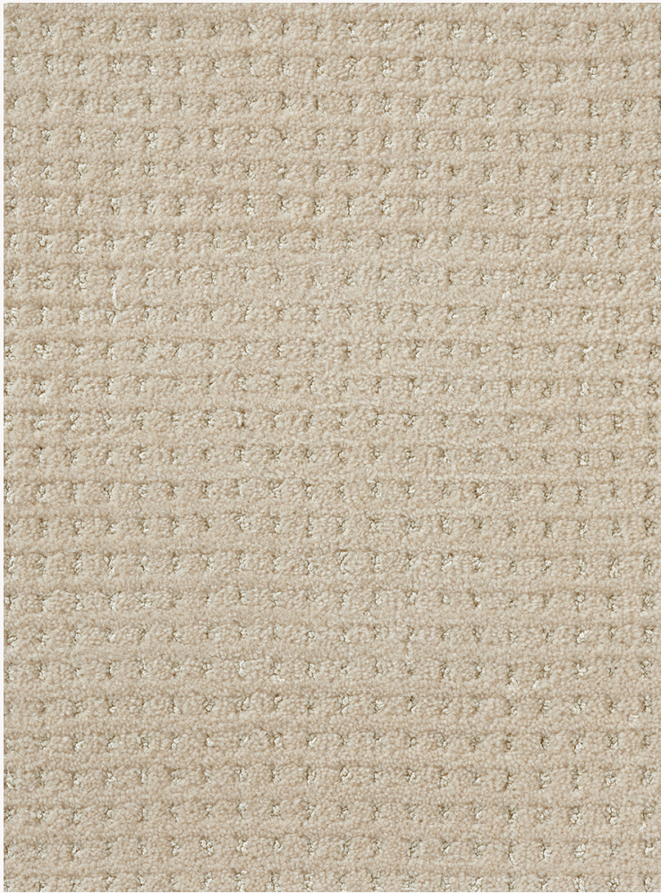
FT357001 - Naturel

Very nice texture in a seed stitch spirit, in cut and loop pile, in New Zealand wool enchanced with shiny nylon.