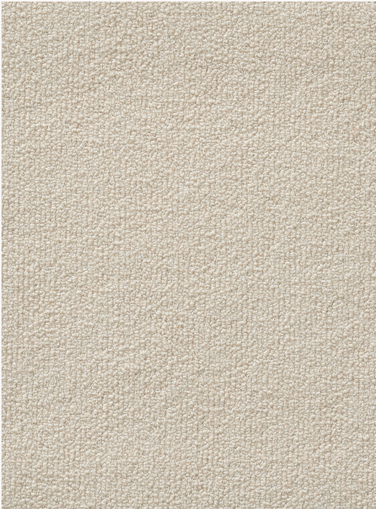
FT382001 - Naturel

Slightly speckled and satin-finished plain, in loop pile blending our New Zealand wool with a shiny nylon thread.