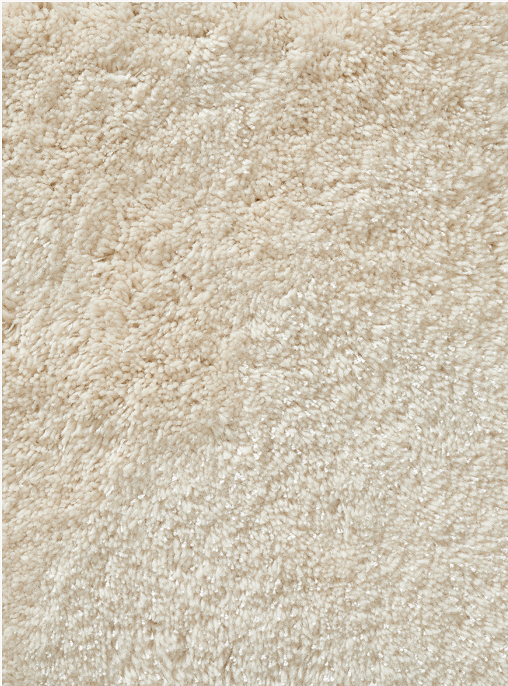
FT384001 - Naturel

Very thick, cozy, mottled and satin look, called "shaggy", in velvet cut from New Zealand wool mixed with a shiny nylon thread.