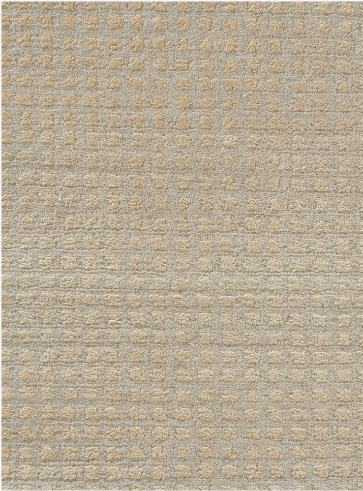
FT397001 - Naturel

Thick plain with small shiny checks, in cut Himalayan wool velvet and silk velvet inserts, in our Nepalese handmade quality.