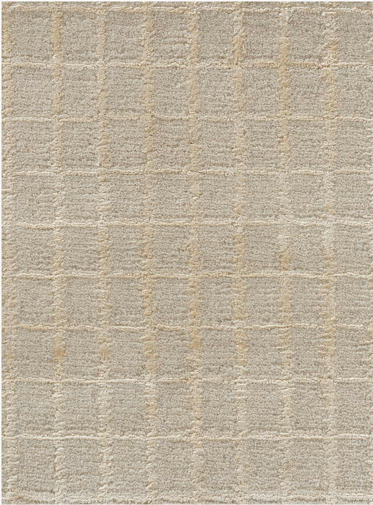
FT401001 - Naturel

Semi-plain plaid with a cut pile made of Himalayan wool cut velvet and silk velvet lines, handmade in our Nepalese quality.