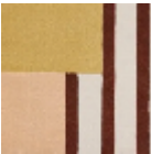
FT422002 OR ROSE