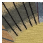
FT487001 MULTICOLOR E