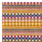
FT507001 MULTICOLOR E