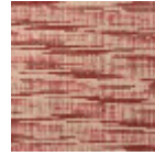
IT111005 Brique rose