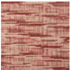
IT111005 Brique rose