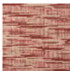
IT111005 Brique rose