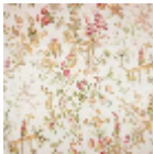
B7553003 Brun de toledo