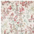
B7553001 Gris bleu