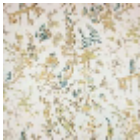
B7553002 Vert persan