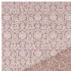
B7606004 Vieux rose