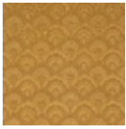
B7668003 Vieil or