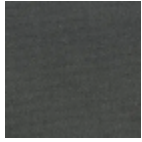
F2754020 Vert de gris