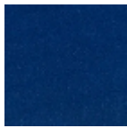
F2754014 Bleu persan