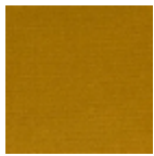
F2754041 Jaune d'or