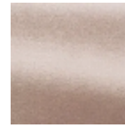
F2945014 Rose ancien