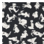
F2984001 Noir & blanc