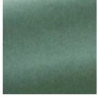
F3070018 Vert de gris