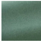
F3070018 Vert de gris