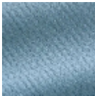
F3130004 Bord de mer