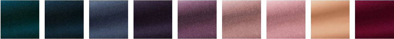
F3212010 Méditerranée F3212011 Navy F3212012 Deep sky F3212013 God save the queen F3212014 Lily F3212015 Piggy F3212016 Sketch F3212017 Powder F3212018 Cherry