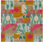
F3226002 Acid Lime