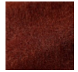
F3290014 Orang outan