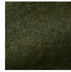
F3290009 Sous bois