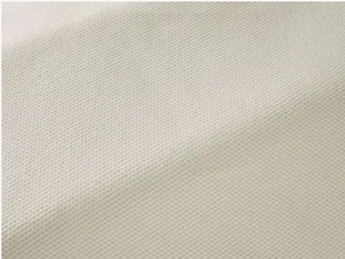
Laize : 136,00 cm / 53,54 inch