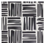
F3484002 Noiret blanc