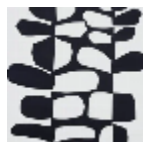
F3485001 Noiret blanc