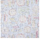
F3538001 MEDITERRAN EE