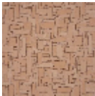
F3815003 Rose des sables