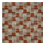
F3816004 Jade tomette