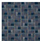
F3816003 Indigo cafe