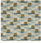
F3816002 Fauve perle