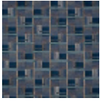
F3816003 Indigo cafe