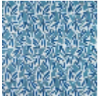
F3829003 Lapis lazuli