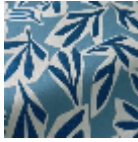
F3829003 Lapis lazuli