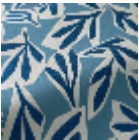
F3829003 Lapis lazuli