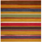
F3958001 MULTICOLOR E