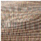
F4035003 TUTTI FRUTTI