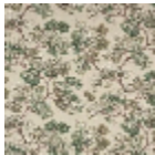
F4111001 FIN D'ÉTÉ